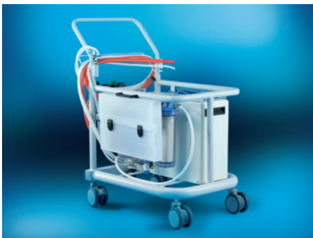
AquaUNO Porter with pretreatment comprising 100 µm backwash filter, 3 × 10" 20 µm, carbon and 1 µm cartridges.